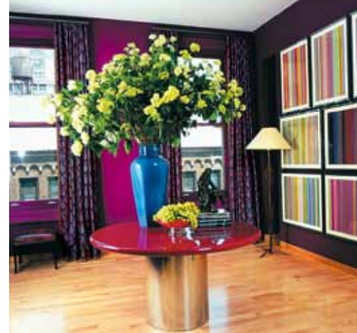
Facts and findings for design professionals