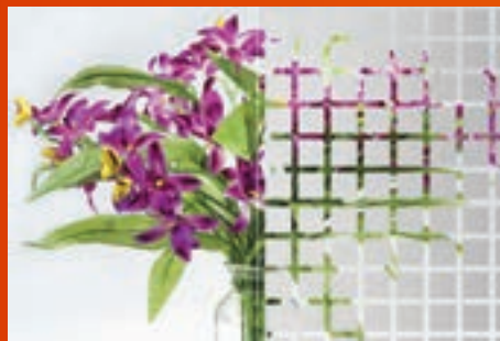
Squares (NRM FSQ)