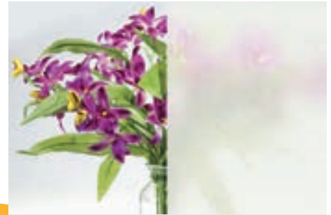
Glacier (NRM55 PS4)