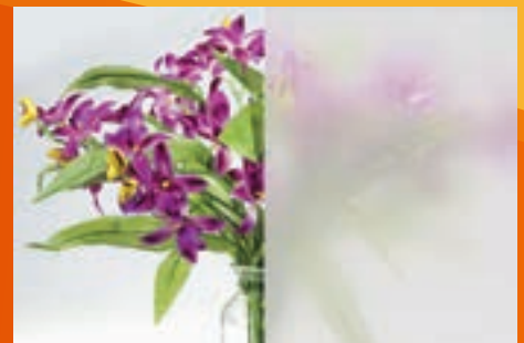
Etched Frost (NRMV60F PS3)