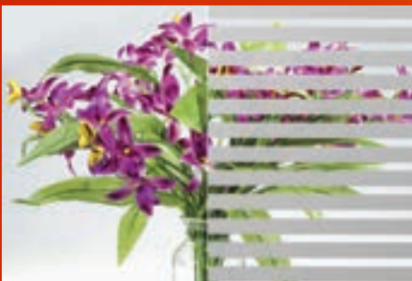
Bands (NRM FB)