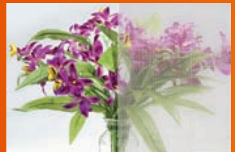
Mini Dots (NRM FMD)