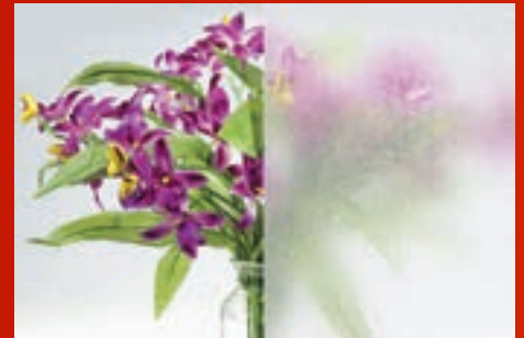
Crackled Glass (NRMV CG)