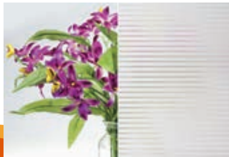
Matte Stripes (NRM MFS)