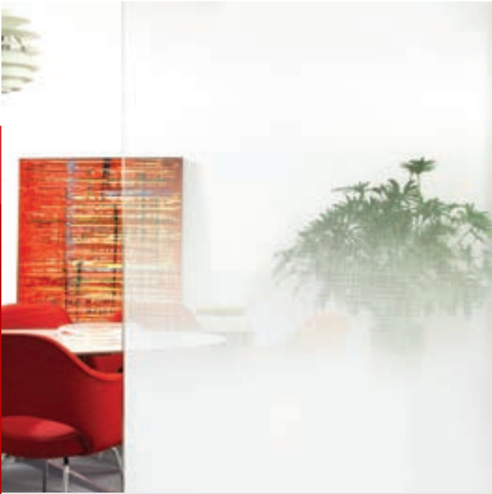
Dot Matrix Gradient