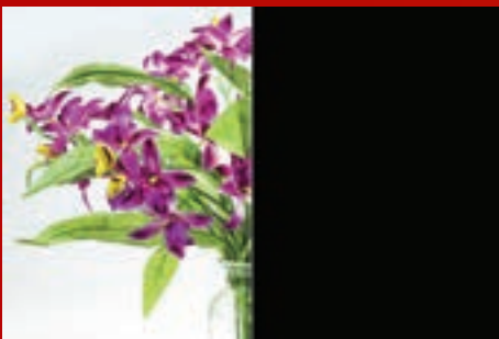
Temporary Black Out