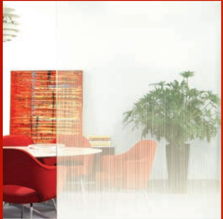
Grass Blade Gradient