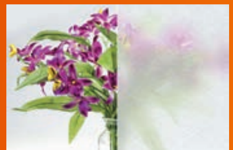
Fiberglass (NRM FIBG)