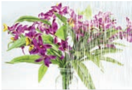
White Wood Grain (shown on cover)