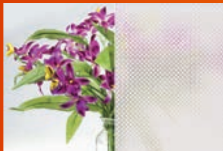
Matte Small Dots (NRM MFSD)