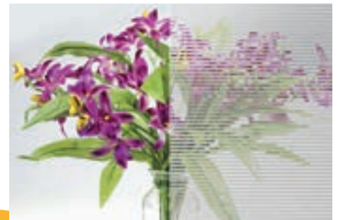
Thin Lines (NRM FTL)