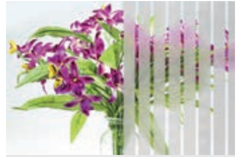
Medium Etched Stripes