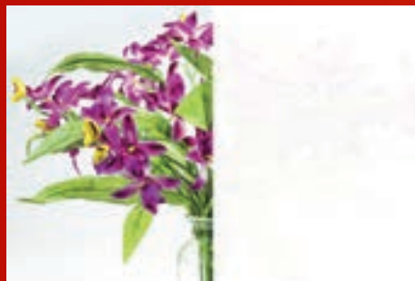
Temporary White Out