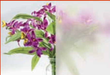
Dusted Crystal (NRMV80DC PS3)