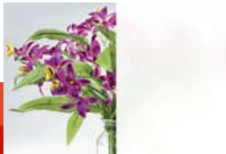
White (NRMW PS3)