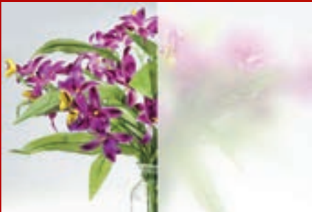
Satin Crystal (NRMV SC)