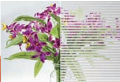
Stripes (NRM FS)