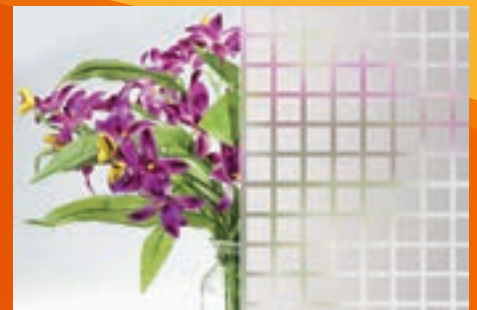
Matte Squares (NRM MSQ)