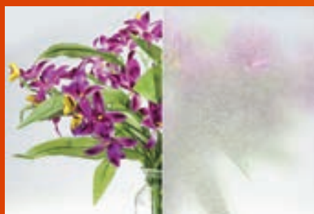
Rice Paper (NRM FRP)