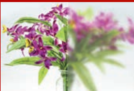
Satin Crystal Clear