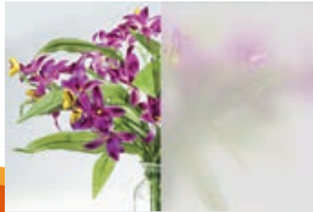
Frost (NRM PS2)