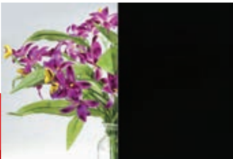
Black (NRMM PS2)