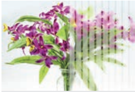
Small Etched Stripes