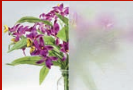
Brushed Crystal (NRMV BC)