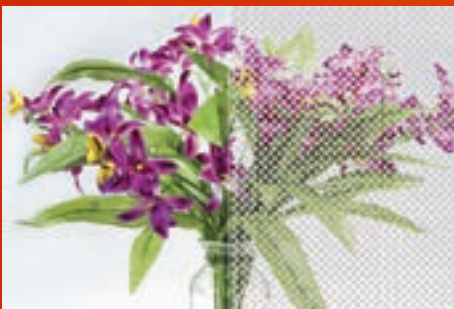
Small Dots (NRM FSD)