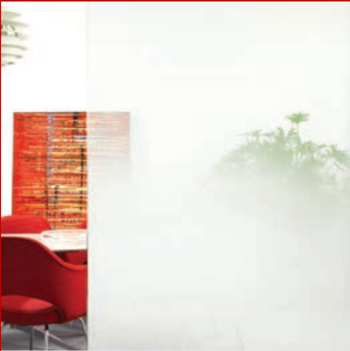
Mirrored Mini Dot Matrix Gradient