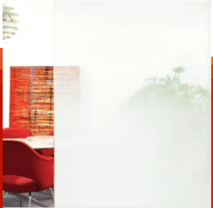
Mini Dot Matrix Gradient