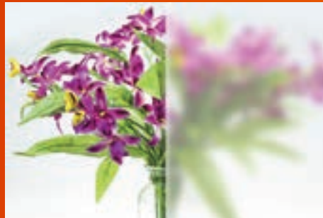
Dusted Crystal Poly